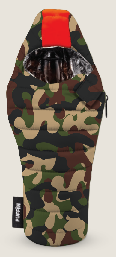
WOODSY CAMO/PUFFIN RED