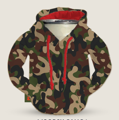
WOODSY CAMO/ PUFFIN RED DO1229-901