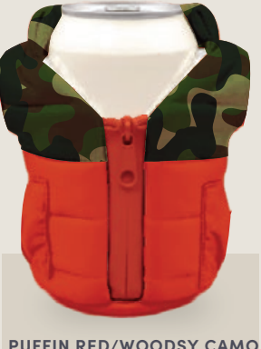
PUFFIN RED/WOODSY CAMO DO1214-650