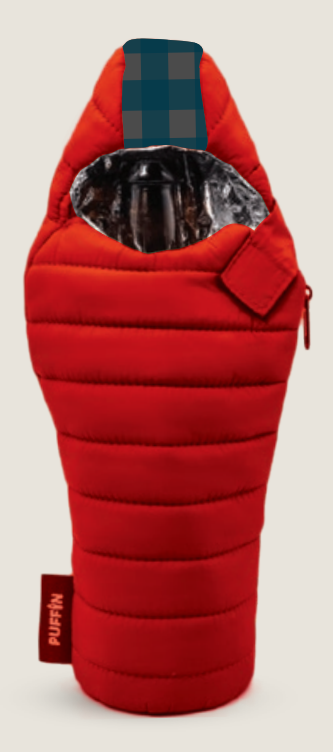
PUFFIN RED/CRATER BLUE DO1207-650