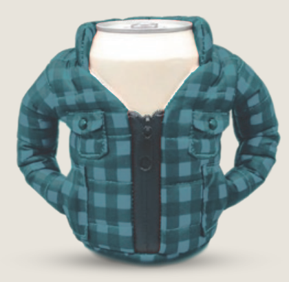
CRATER BLUE DO1195-451

you can focus on what's important—like trees 'n' stuff.