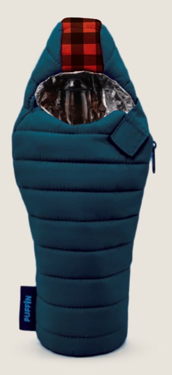
SAILOR BLUE/PUFFIN RED DO1207-470

The OG symbolizes how the best ideas are born around a campfire with friends. An old scrap of sleeping bag became the first Puffin, and lovers of cold beverages everywhere rejoiced.