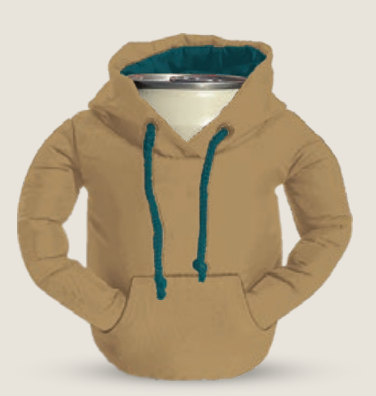
TACO TAN/ SAILOR BLUE