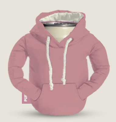
DUSTY ROSE/ SANDY WHITE