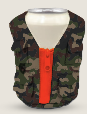
WOODSY CAMO DO1193-901