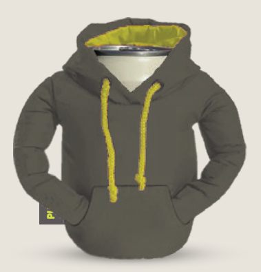
PEWTER/KEYLIME PIE DO1229-050