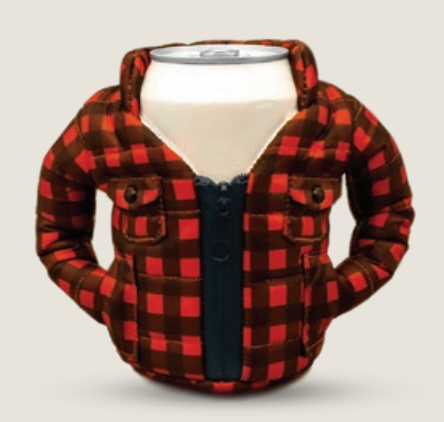
PUFFIN RED DO1195-651

When you're busy doing woodsy lumberjacky things, this plaid flannel drinkwear insulates your bevvy so